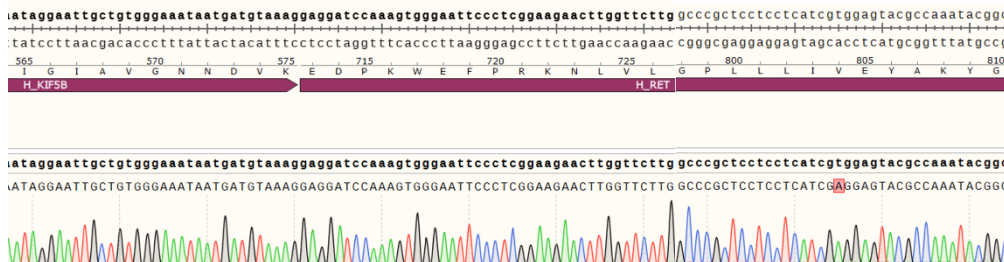
Figure 2 | The KIF5B-RET mutation analysis by Sanger sequencing.